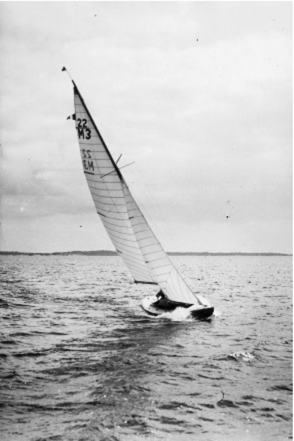
"Mälär 22"; "A6 Segling" by Norberg, Oscar - National Maritime Museum, Sweden - Public Domain. https://www.europeana.eu/en/item/916109/smm_sm_photo_Fo133481