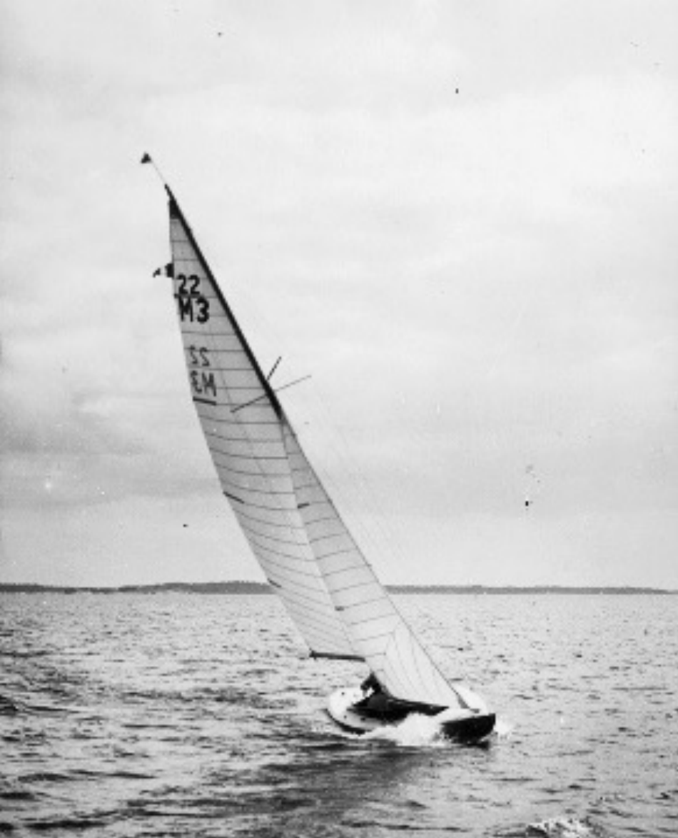
"Mälar 22"; "A6 Segling" by Norberg, Oscar - National Maritime Museum, Sweden - Public Domain. https://www.europeana.eu/en/item/916109/smm_sm_photo_Fo133481